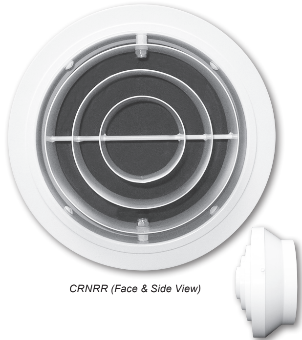
CRNRR (Face & Side View)